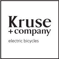
Chiseled Dark letters on white background*