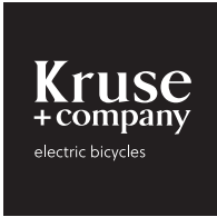
Chiseled White letters on dark background*