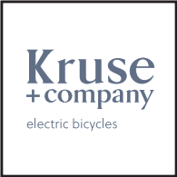
Dark-blue letters with drop-shadow

Kruse + Company wordmark on blue background. White lettering with company blue "drop-shadow". Product identifier ("electric bicycles") should be used when the logo is on the square field, but may be eliminated when appropriate.